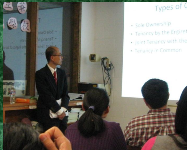
Buying a Home