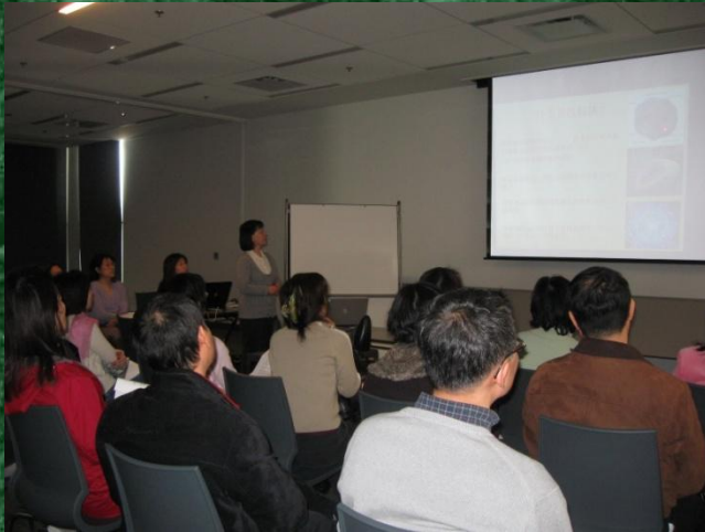
Living a Healthy Life