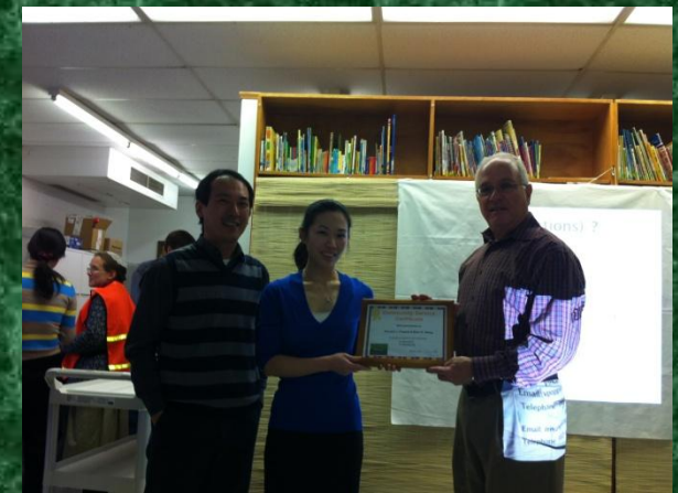
Mitigation & Arbitration